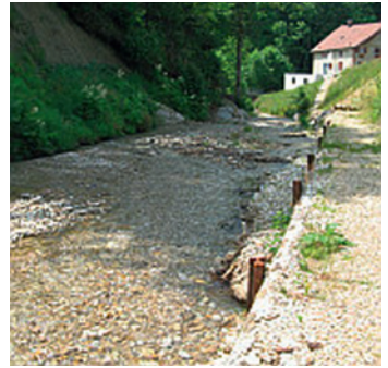
municipality of Luthern