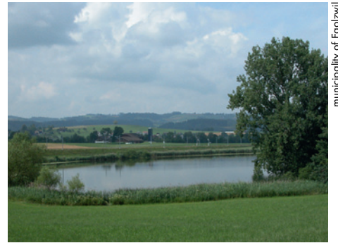
municipality of Egolzwil

Spatial planning region 5 Subregion 52 Wauwilermoos