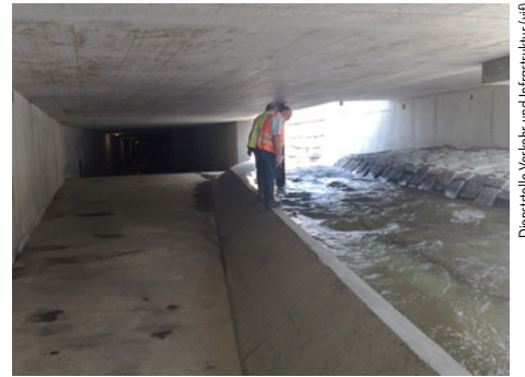
Dienststelle Verkehr und Infrastruktur (vfi)