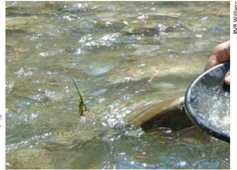
Panning for gold in the „Wigger“ river

CVP, JCVP: Christian Democratic Party SVP, JSVP: Swiss People's Party AS: Active Senior Citizens Green, JG: Green Party FDP: Free Democratic Party 60plus: 60plus SP: Social Democratic Party