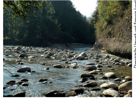
Dienststelle Umwelt und Energie (uwe)