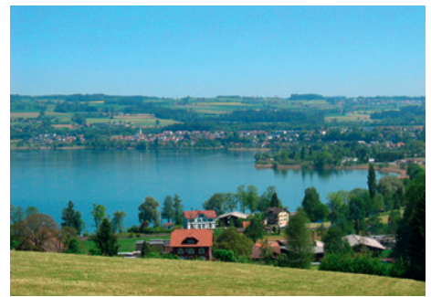
View of the "Sempacher" lake