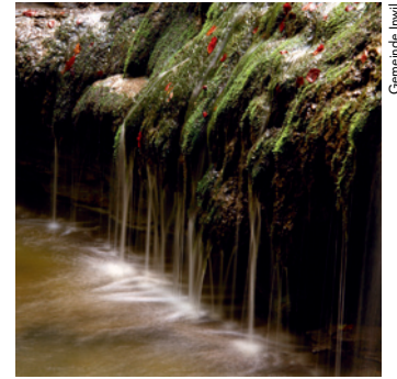
Waterfall near Inwil

CVP, JCVF: Christian Democratic Party SVP, JSVP: Swiss People's Party AS: Active Senior Citizens Green, JG: Green Party FDP: Free Democratic Party 60plus: 60plus SP: Social Democratic Party