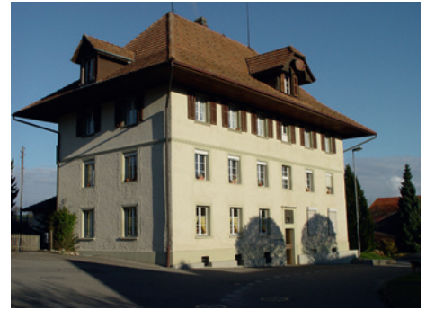
Old schoolhouse (1857)

CVP, JCVP: Christian Democratic Party SVP, JSVP: Swiss People's Party AS: Active Senior Citizens Green, JG: Green Party FDP: Free Democratic Party 60plus: 60plus SP: Social Democratic Party