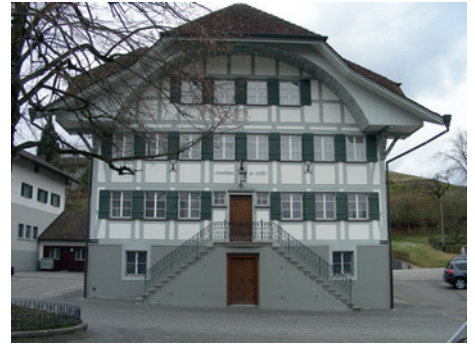
Town hall „Wölfen“

CVP, JCVP: Christian Democratic Party SVP, JSVP: Swiss People's Party AS: Active Senior Citizens Green, JG: Green Party FDP: Free Democratic Party 60plus: 60plus SP: Social Democratic Party