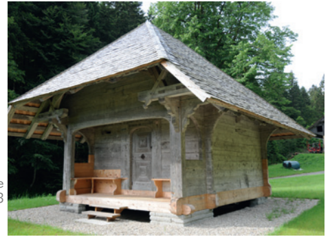
Cheese storehouse „Wiggerhütte“, built in 1833