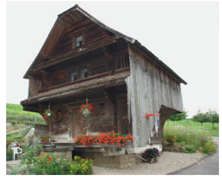
Granary „Chneubüelerhof“ in Eppenwil, built in 1727