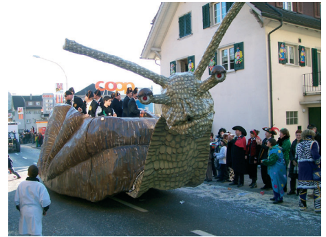
Carnival parade in Wolhusen

CVP, JCVP: Christian Democratic Party SVP, JSVP: Swiss People's Party AS: Active Senior Citizens Green, JG: Green Party FDP: Free Democratic Party 60plus: 60plus SP: Social Democratic Party