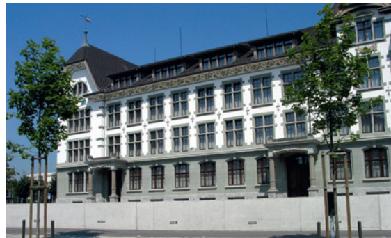
Schoolhouse „Alt St. Georg“