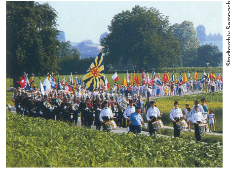
Anniversary Celebration of the battle of Sempach