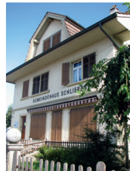
The 100-year-old building was used as a store until 1994 when it was renovated to become the town hall