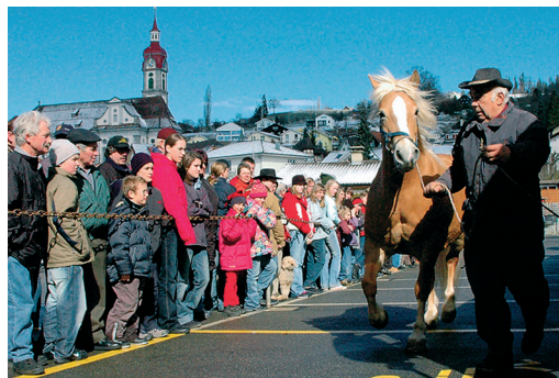
Spectators at the local horse market