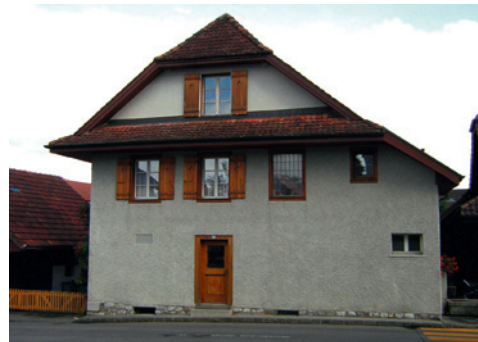
Pfeffikon's first schoolhouse

CVP, JCVP: Christian Democratic Party SVP, JSVP: Swiss People's Party AS: Active Senior Citizens Green, JG: Green Party FDP: Free Democratic Party 60plus: 60plus SP: Social Democratic Party