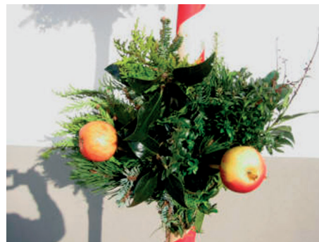
Decoration on Palm Sunday