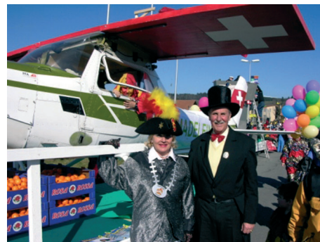
Carnival parade 2007

CVP, JCV: Christian Democratic Party SVP, JSVP: Swiss People's Party AS: Active Senior Citizens Green, JG: Green Party FDP: Free Democratic Party 60plus: 60plus SP: Social Democratic Party