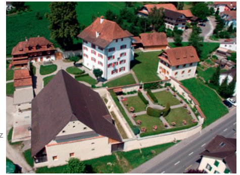
Castle of Buttisholz