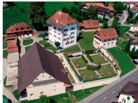
Castle of Buttisholz