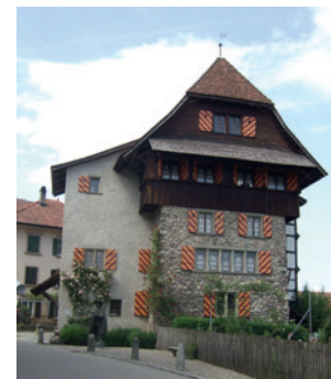
The museum in Beromünster's castle is home to Switzerland's oldest printing press