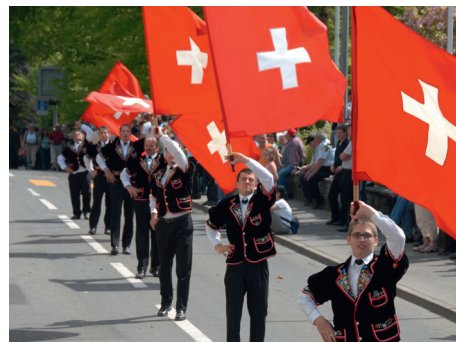
Parade at the „Sennenchilbi“ (traditional alpine herdsman funfair)

CVP, JCVP: Christian Democratic Party SVP, JSVP: Swiss People's Party AS: Active Senior Citizens Green, JG: Green Party FDP: Free Democratic Party 60plus: 60plus SP: Social Democratic Party