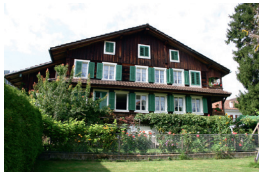
„Mattenmai“ (1506) has served as the town hall and police station