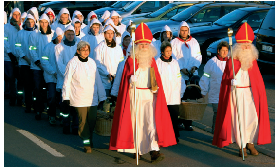
Saint Nicholas' Day in Udligenswil