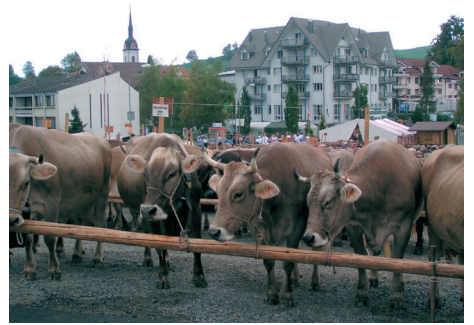
Traditional cattle exhibition in Schwarzenberg: In 2007, the organising cooperative celebrated its centenary