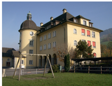
Schoolhouse St. Martin

CVP, JCVP: Christian Democratic Party SVP, JSVP: Swiss People's Party AS: Active Senior Citizens Green, JG: Green Party FDP: Free Democratic Party 60plus: 60plus SP: Social Democratic Party