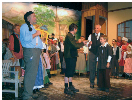
Scene from „Fidelen Bauer“, performed by the drama group Root

CVP, JCVP: Christian Democratic Party SVP, JSVP: Swiss People's Party AS: Active Senior Citizens Green, JG: Green Party FDP: Free Democratic Party 60plus: 60plus SP: Social Democratic Party