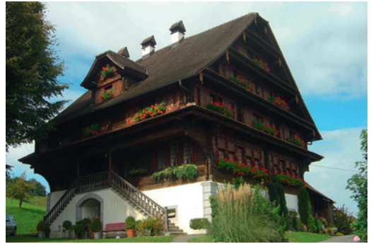
Private dwelling belonging to the „Hinterspichten“ homestead