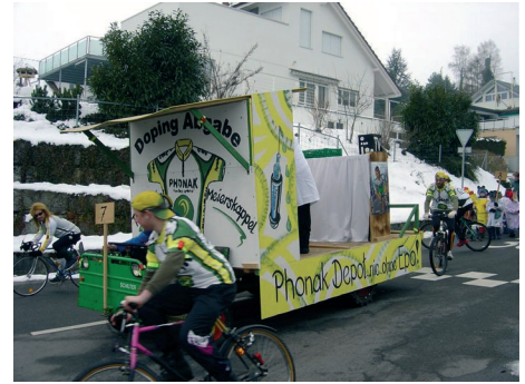
Children's carnival parade in Meierskappel