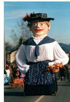
„Eierrosi“ at the carnival parade in Littau