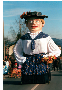
„Eierrosi“ at the carnival parade in Littau