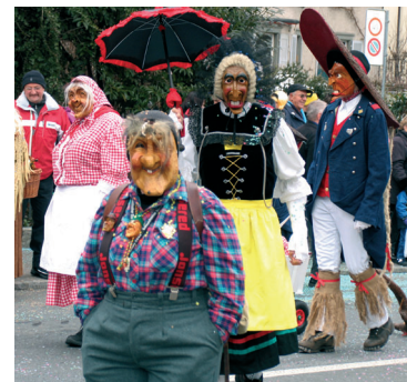
„Wöschwiib“, „Bernerwiib“, „Krienserdeckel“: Traditional masks at the carnival of Kriens