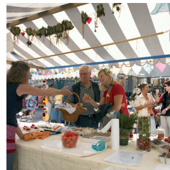
Scene at the village market