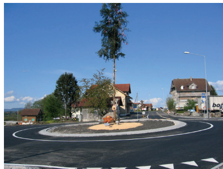
Inauguration of the new roundabout „Honau“