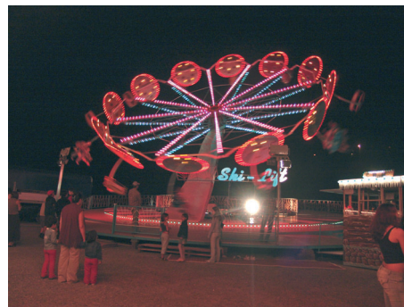
Funfair in Gisikon

CVP, JCVP: Christian Democratic Party SVP, JSVP: Swiss People's Party AS: Active Senior Citizens Green, JG: Green Party FDP: Free Democratic Party 60plus: 60plus SP: Social Democratic Party