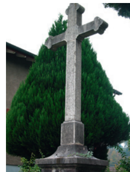
The Sigmund cross on Kaspar Kopp Street commemorates to the reception of the German Emperor Sigmund by the authorities of Lucerne in Ebikon in the year 1417