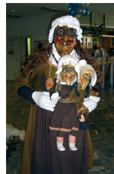
„Hundsrügg-Huri“, legendary character