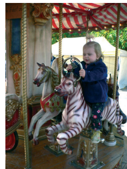
Funfair in Dierikon