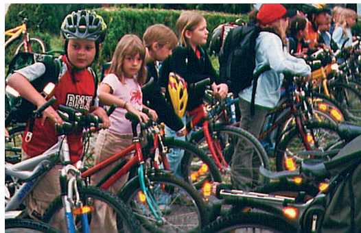
Benediction of bikes on the first school day

CVP, JCV: Christian Democratic Party SVP, JSVP: Swiss People's Party AS: Active Senior Citizens Green, JG: Green Party FDP: Free Democratic Party 60plus: 60plus SP: Social Democratic Party