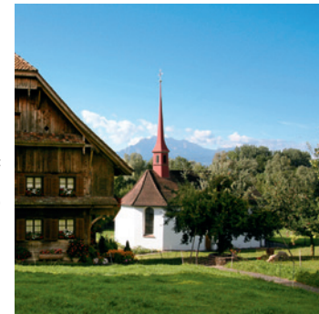
The St. Katharina chapel was built on the site of the first convent of Eschenbach in 1429 and restored in 1989