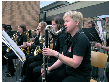
The „Musikgesellschaft Inwil“ at concert