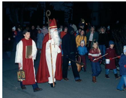
Saint Nicholas' Day in Hohenrain

CVP, JCVP: Christian Democratic Party SVP, JSVP: Swiss People's Party AS: Active Senior Citizens Green, JG: Green Party FDP: Free Democratic Party 60plus: 60plus SP: Social Democratic Party