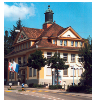
Town hall, built in 1913/14 by the architects Möri and Krebs