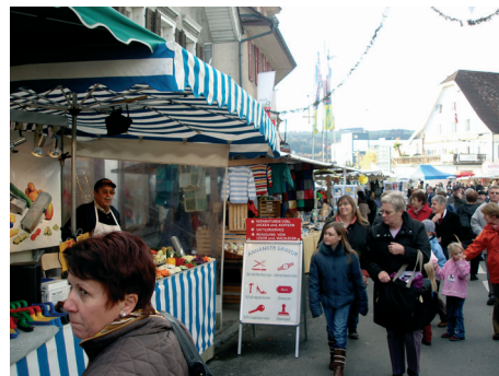
Market bustle at the „Martinimärt“

CVP, JCVP: Christian Democratic Party SVP, JSVP: Swiss People's Party AS: Active Senior Citizens Green, JG: Green Party FDP: Free Democratic Party 60plus: 60plus SP: Social Democratic Party