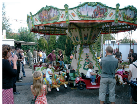
Funfair in Ballwil

CVP, JCVP: Christian Democratic Party SVP, JSVP: Swiss People's Party AS: Active Senior Citizens Green, JG: Green Party FDP: Free Democratic Party 60plus: 60plus SP: Social Democratic Party