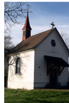
The devotional chapel in Altwis was built in 1902 and renovated in 1980