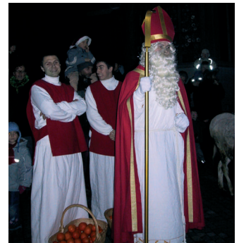
Saint Nicholas' Day in Wertheimstein