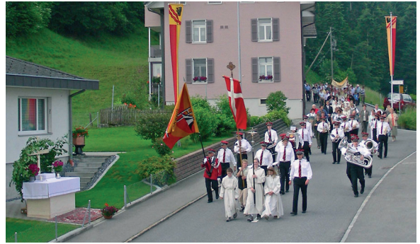
Church parade on Corpus Christi

Romoos is part of the UNESCO biosphere Entlebuch