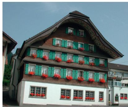
The hotel „Three Kings“

Entlebuch is part of the UNESCO biosphere Entlebuch